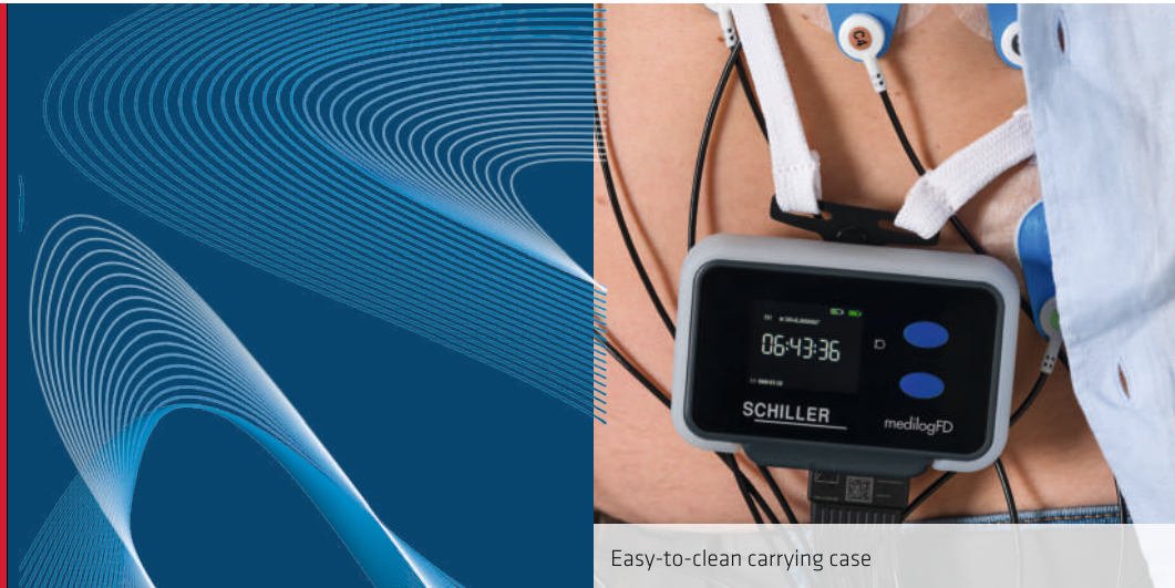
Easy-to-clean carrying case