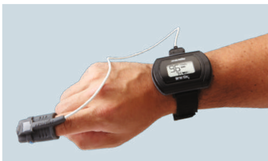
Wireless SpO 2 sensor, attached for the night