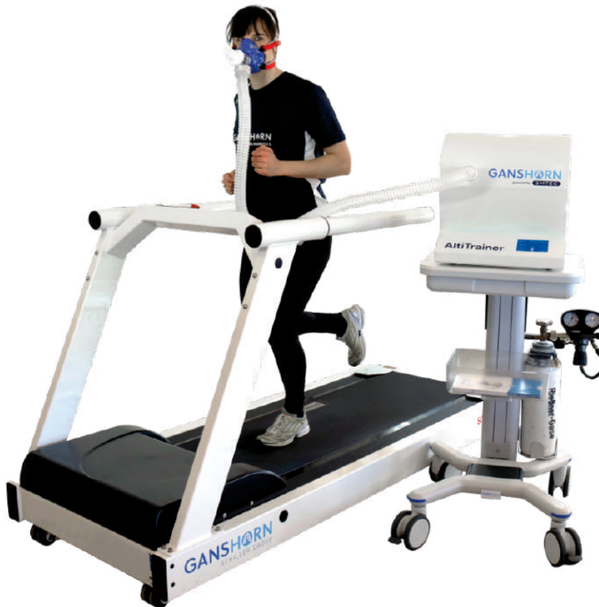
Use with treadmill

Hypoxia training with the AltiTrainer® is suitable for all sports on stationary equipment, be it treadmills, ergometers or e.g. rowing machines. It offers full flexibility and can be quickly switched between different devices. Therefore one single AltiTrainer® meets the needs of different user groups, which makes its use very effective.