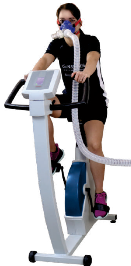
Use with ergonomic bike