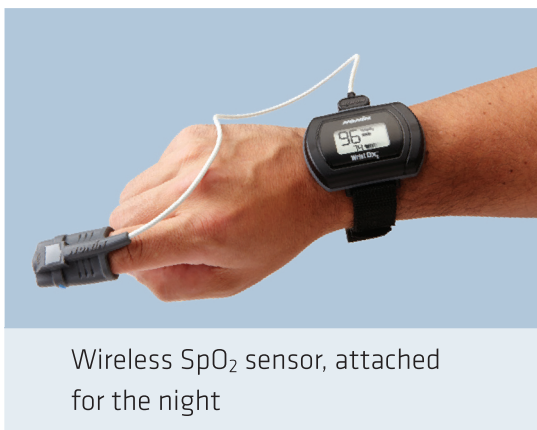
Wireless SpO 2 sensor, attached for the night