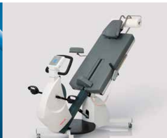
ERG 911 L: couch/semi-couch safety ergometer, infinitely variable from 0° – 45°