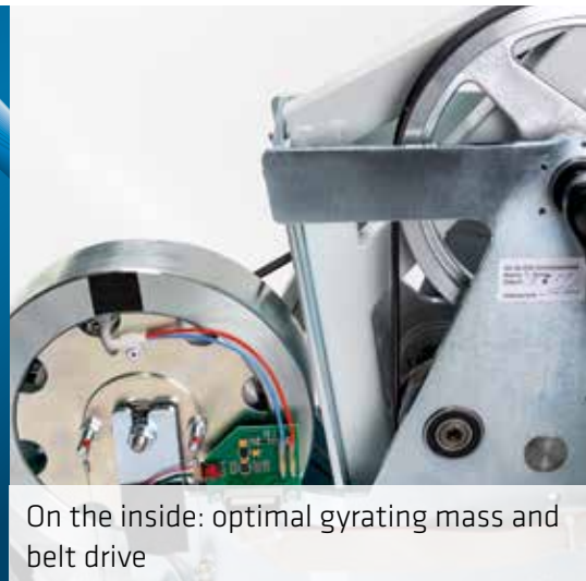
On the inside: optimal gyrating mass and belt drive

The ergometers ERG 910 plus and ERG 911 plus have been developed for use in the cardiology sector. They are very stable thanks to the steel tube construction. Therefore, they are suitable for patients weighing up to 160 kg, with stabiliser (optional) even up to 200 kg. The units are compact and use minimal floor space.