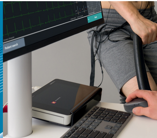
Exercise stress ECG with CARDIOVIT FT-1