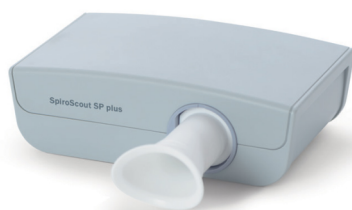
Ultrasound spirometer SpiroScout SP plus