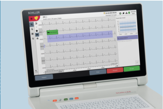
Create a 10 seconds resting ECG from a resting rhythm recording of up to 20 minutes with ECG Framer